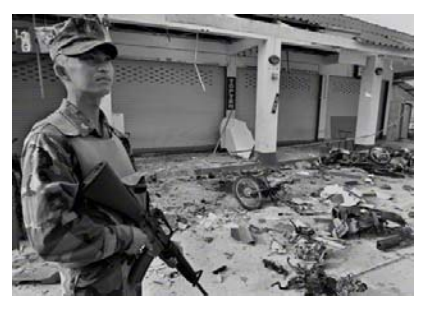
A Thai soldier on guard as motorcycles lie wrecked in front of bars behind the Marina Hotel in Sungai Kolok district,

A Thai Muslim girl looks at her classroom in Muang Narathiwat school, which was burnt down in January 2004 by a group of unidentified assailants. They set fire to eighteen schools and attacked a military armory, killing four soldiers, in almost simultaneous raids in Narathiwat province 805 kilometers (500 miles) south of Bangkok. About ninety per cent of Thailand's sixty two million people are Buddhist. The Moslem minority is concentrated in the southern provinces of Pattani, Yala, Narathiwat, Satun and Nakhon Si Thammarat.