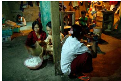
Very often people in the same room come from the same village and follow the same customs as they do at home. Here, the women prepare the food.