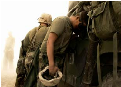
Marines protecting themselves from sandblast. Iraq. Chesty Camp, 40 miles north-west of Alkut.

"We don't rule out an image categorically because of the camera it has been shot with. Our main concern is that it is compatible with GEO standards. "So, if the subject matter is sufficiently valuable and the file printable we would publish that image."