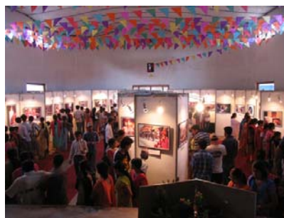
Visitors through the traveling photo exhibition of images from the book A People's War when it arrived in the central Nepal city of Pokhara in April 2007. By Kunda Dixit.