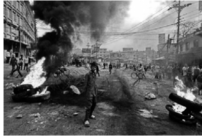
Tries burn on the streets during pro-democracy demonstrations in April 2006.