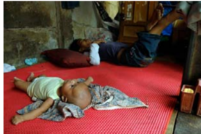
The children live in the same poor conditions as their parents.