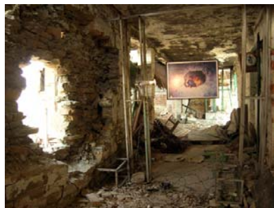
Amrit Gurung's photograph of a bombed-out police station hanging inside the Chautara District Hospital, which was destroyed in a battle in 2005. By Kunda Dixit.