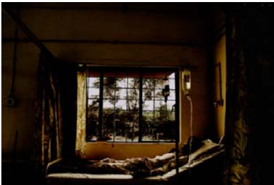
A patient in intensive care. Chennai (Madras), India.