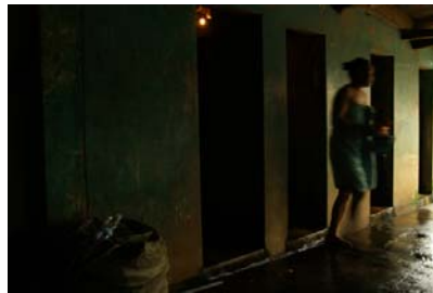
As they cannot find jobs in their villages, the workers come to Jakarta to realize their dream; earning money to be sent to their families back home. There are only five bathrooms shared with almost sixty people at once.