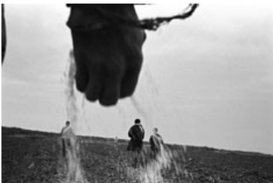
Tolga Sezgin ©

Welcome to the ninth edition of Enter, the online magazine of World Press Photo's Education Department.