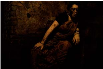
In a brothel inside the Bahu Bazar red light area, Calcutta, India. June 2002.