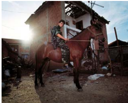
UCK (National Liberation Army) Fighter. Macedonia, 2001