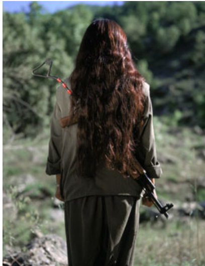
PKK (Kurdistan Workers' Party) female fighter. Northern Iraq, 2007