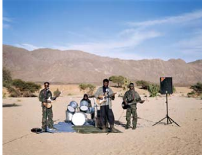
A rock band made up of MNJ (Nigerien Movement for Justice) rebels. Northern Niger 2008.

To continue my personal project on rebel groups.