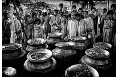
Refugees wait for tea at Sheikh Yassin camp. The displacement of two million civilians is Pakistan's largest since the Indian subcontinent was split in 1947.

Other images in the gallery - taken with his Nikon D700 and D300 using natural light - show some of the devastation of the situation as the army hits the militants and they retaliate.