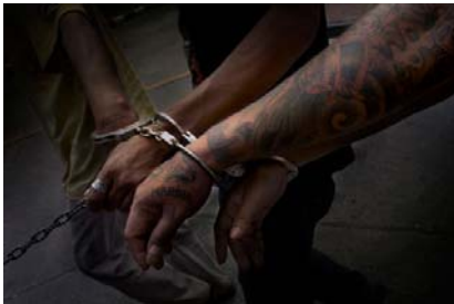
Handcuffs on newly arrested drug dealers and users are shown to reporters and photographers during a press conference.

In each issue of Enter, we put a set of near-identical questions to people who have taken part in a World Press Photo Joop Swart Masterclass.