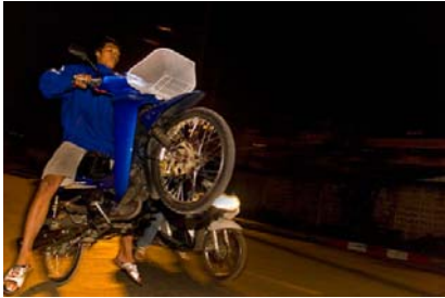
Bangkok's Thai street racers elude the police and show off their riding skills.