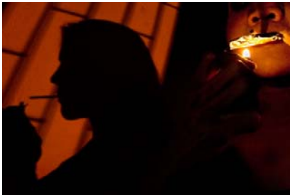
A "ladyboy" prostitute, who is also a drug runner, smokes methamphetamine by putting a tablet on cigarette packet foil and heating it with a small flame from an adapted lighter.